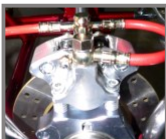
Self adjusting radial fitting

The new aerodynamic streamlined bodyworks are performed within PAROLIN RACING KART's facilities.