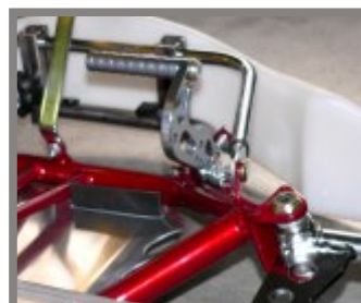
Adjustable bearing holders