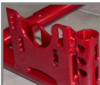
Billet alloy pedals option